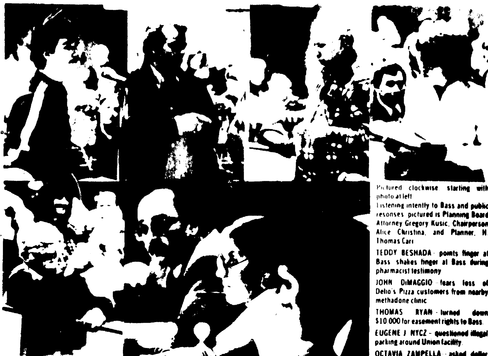
Pictured clockwise starting with photo at left