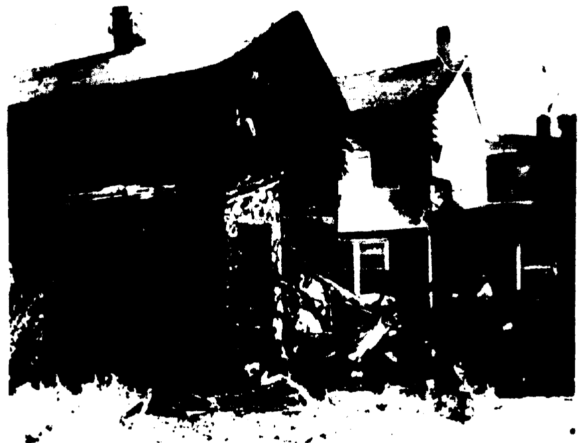
Firemen survey rubble left in the aftermath of early morning fire.