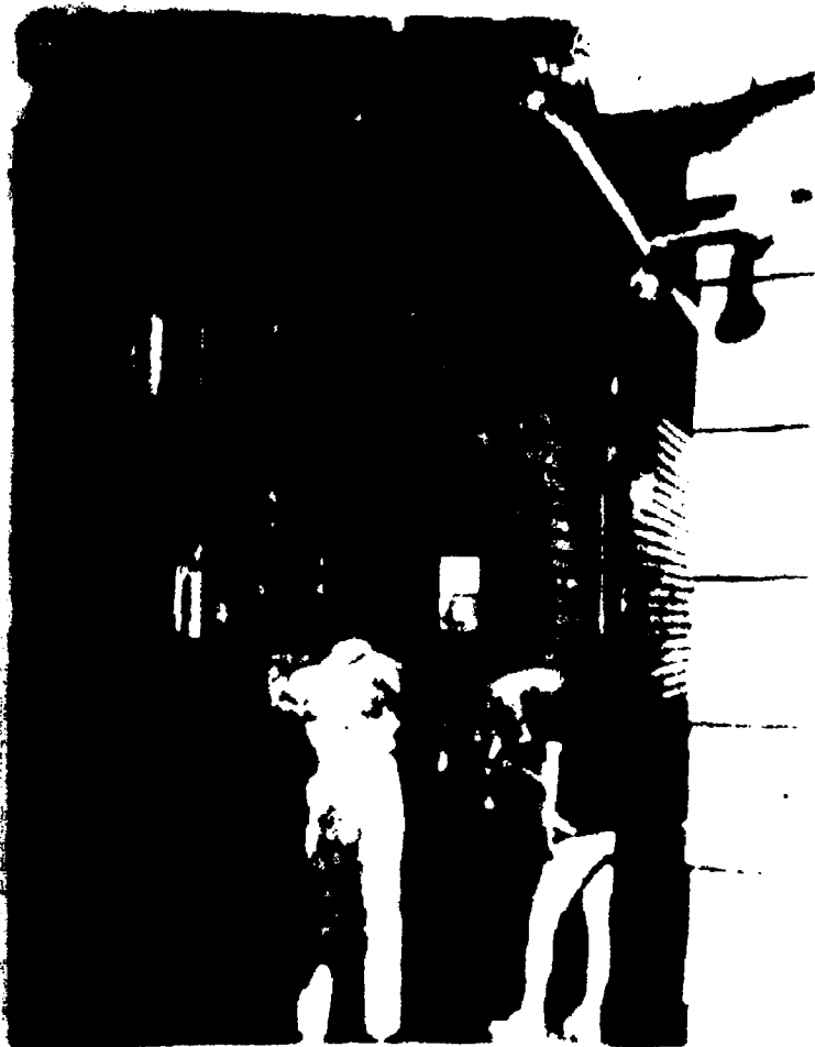
After the fire is completely out, the Middlesex County Prosecutor's Office Task Force confirms South Amboy Task Force reports the fire began in the rear of the abandoned building. Note the close proximity of the restaurant door.