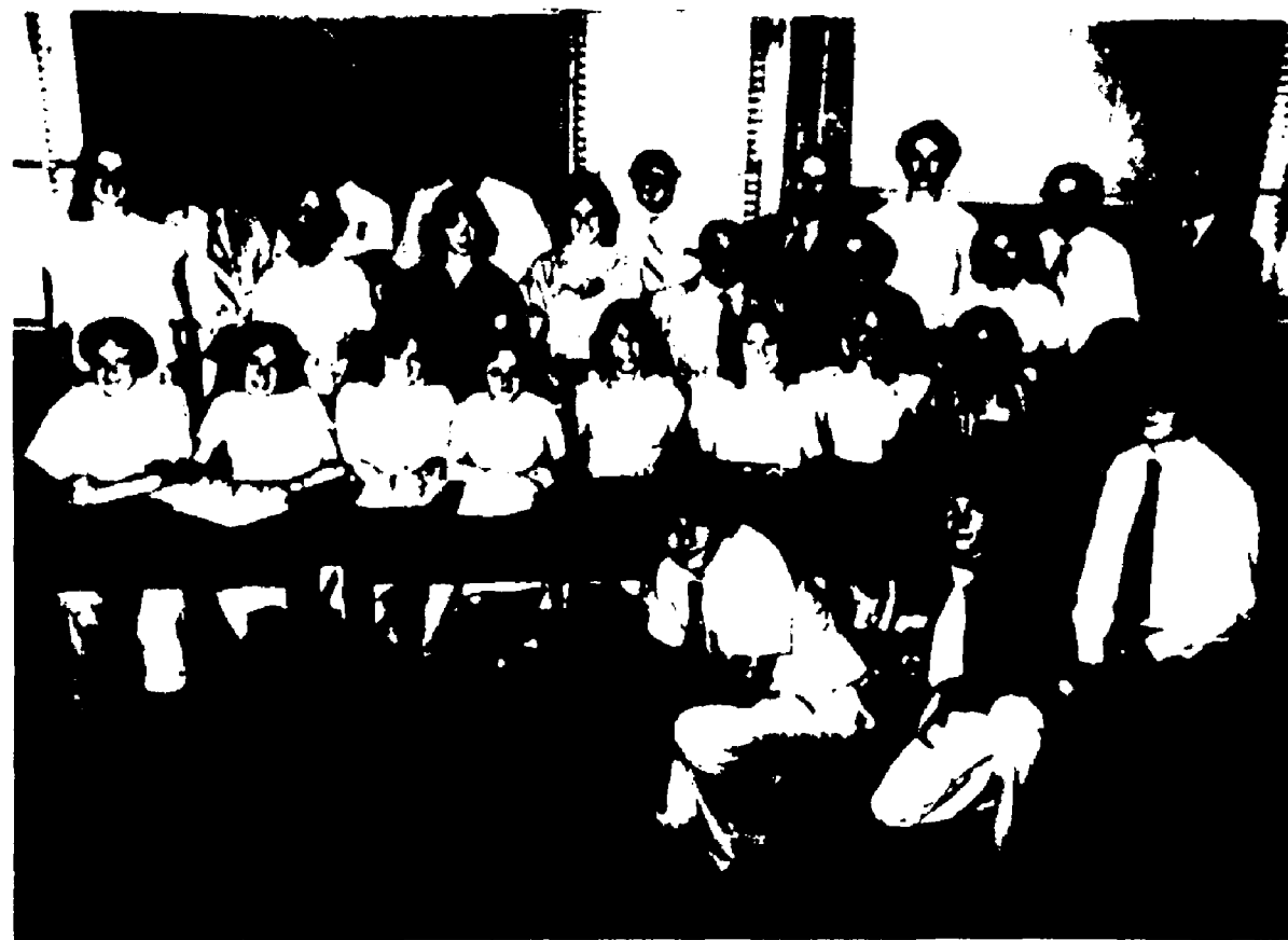
SOUTH AMBOY TODAY AND TOMORROW-lined up together at City Hall in observance of Youth Day in City Government May 9. Hoffman High and St. Mary's senior classes contributed the tomorrows. (Left to right)